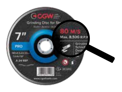
ILL. 1. Observe maximum safe operating speed

Machine speed shall be set and measured to make sure that it does not exceed the maximum operating speed designated for the abrasive wheel (ILL. 1).